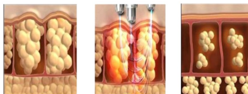
Cellulite prone skin → RF treatment → Skin appears smoother

It is now widely accepted that radio frequency is the best currently available technology for non-invasive, non-surgical skin tightening and cellulite removal.